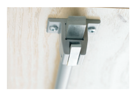
376ELTS - Extra long top shoot

A range of additional or alternative components is available for the 376 Series of exit hardware.