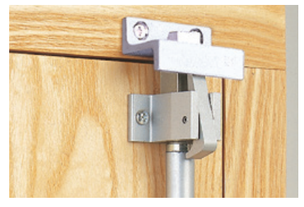
376FFKP - Flush face keeper plate

Suitable for doors that require the push bar to be in a lower position e.g schools. It can also be used on doors up to 3350mm high.