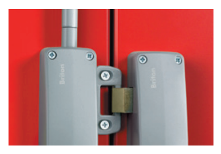
378MDS metal door strike

for use with Briton 378 rim devices on single doors, or on the first opening leaf of a double rebated application.