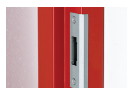
379MDS metal box strike

For customers who prefer machine screws, alternative fixing packs are available.