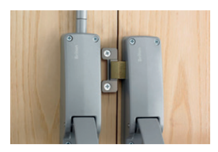
378DDS - Double door strike

For applications where there is a flush head frame a flush face keeper plate can be used to secure the bolt.