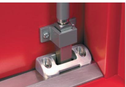
376MDS metal door strike

For vertical panic bolts. Comprises 2 strike plates and 1 trip plate to activate the top tripper.