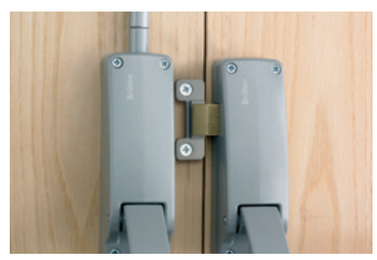
378DDS - Double door strike

For applications where there is a flush head frame a flush face keeper plate can be used to secure the bolt.