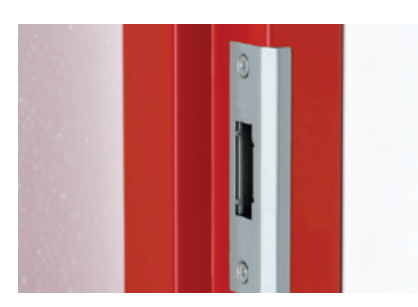
379MDS metal box strike

For customers who prefer machine screws, alternative fixing packs are available.